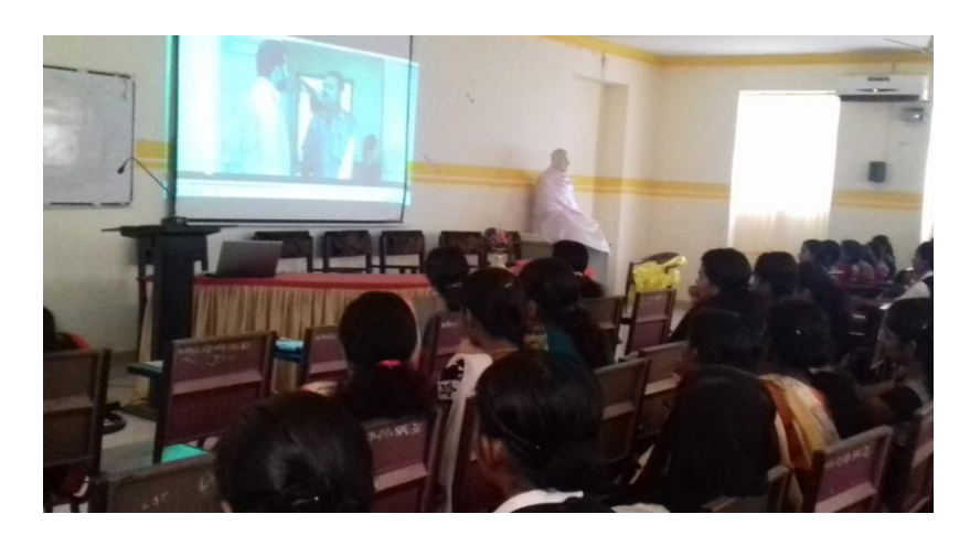
Presentation of film 101 chodyangal